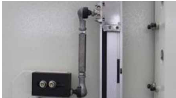
PRECISION GIVI GRATING RULER