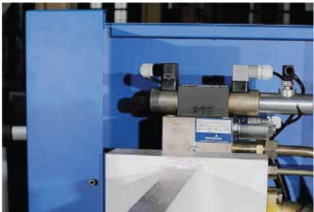
PRECISION GERMAN HAWE HAUDRAULIC VALVE