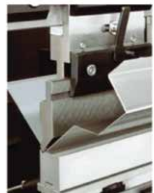
Press Brake Sketch Map