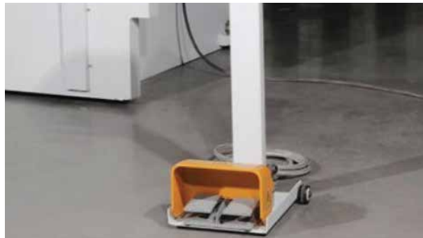
MOVABLE PEDAL SWITCH STATION WITH EMERGENCY STOP BUTTON