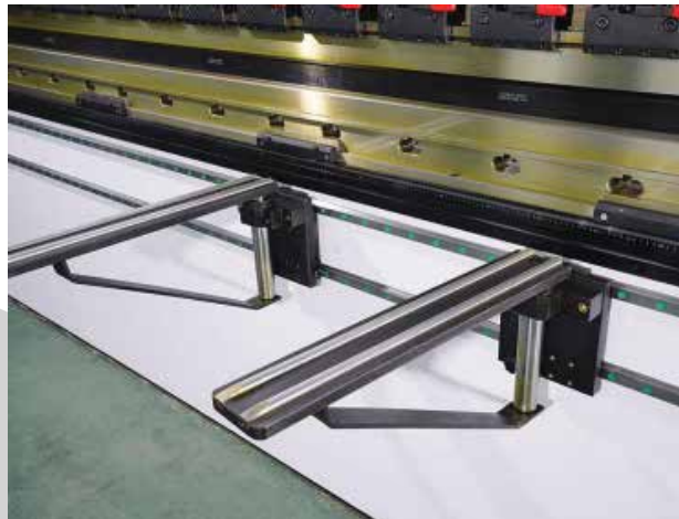
FRONT SUPPORTS WITH DUAL LINEAR GUIDE RAIL