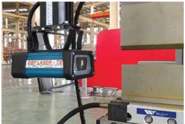
DSP LASER PROTECTION SAFETY SYSTEM - OPTION