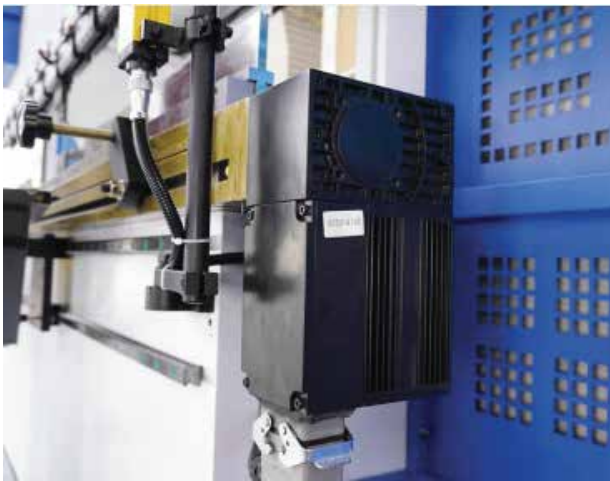
AUTOMATIC TABLE CROWNING