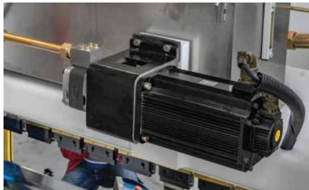
CHINA ESTUN SERVO MOTOR