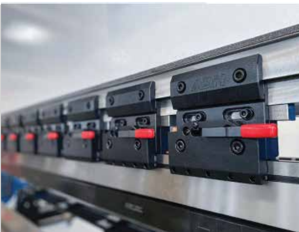
ADH FAST CLAMPING SYSTEM