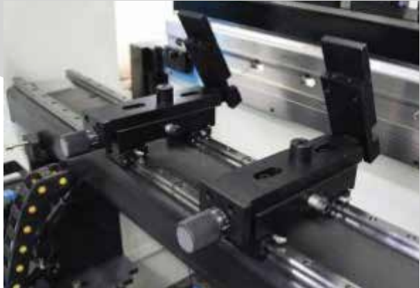
ADH CUSTOM DESIGN BACK-STOP FINGERS