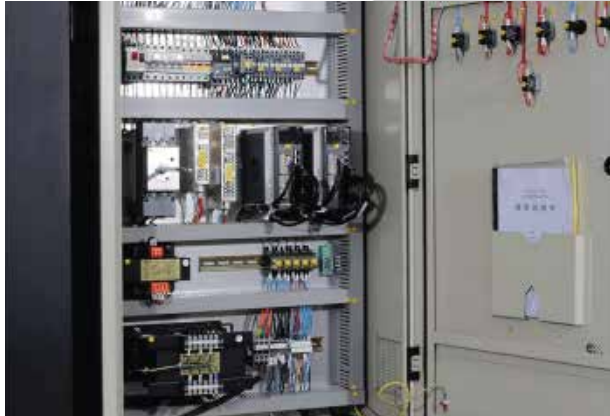
FRENCH SCHNEIDER ELECTRONICS