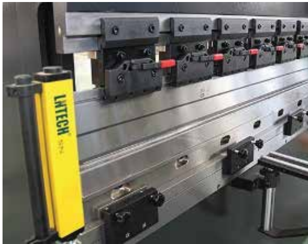
LHTECH LIGHT CURTAIN SAFETY